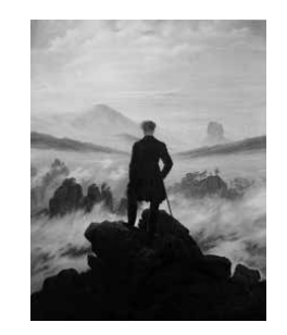
fig. 11 Caspar David Friedrich Wanderer above the Sea of Fog (1818), Kunstballe Hamburg.